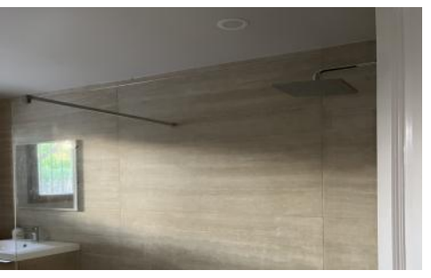
Ensuite bathroom with walk in shower