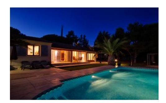
Night pool shot