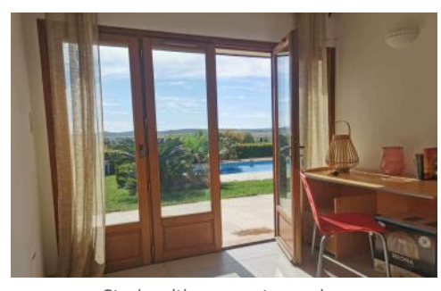
Study with access to garden