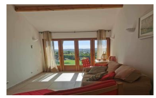
Study with garden views